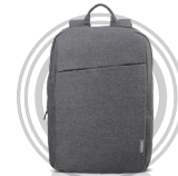
Lenovo 15.6" Laptop Casual Backpack B210