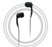
Lenovo 100 In-Ear Headphone