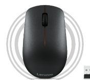
Lenovo 400 Wireless Mouse