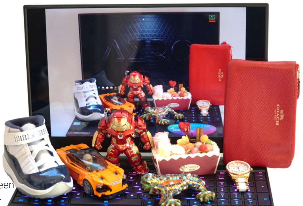
Photo: Colors displayed on screen almost match the actual colors.

Stunning Visual for both Work& Entertainment