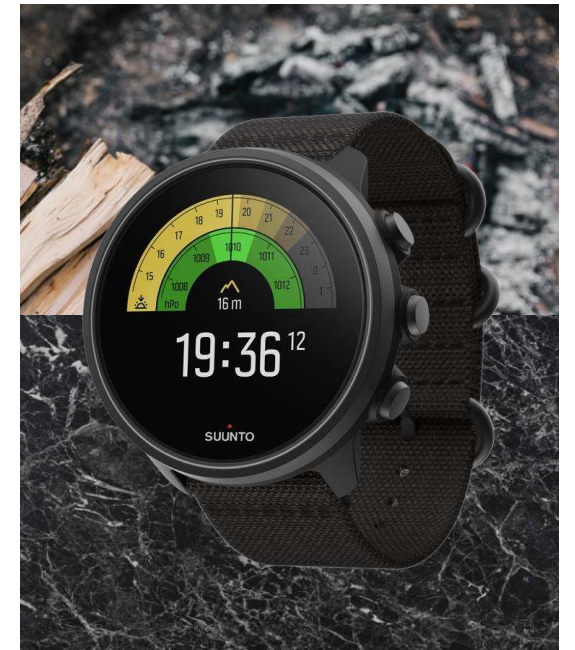
Suunto 9 Baro Charcoal Black Titanium