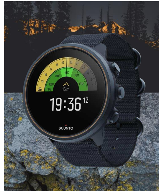
Suunto 9 Baro Granite Blue Titanium

Suunto 9 is an ultra-endurance GPS watch with exceptional battery life. Now available in two new outdoor inspired designs, with extreme durability and a feature set optimized for the toughest outdoor adventures.